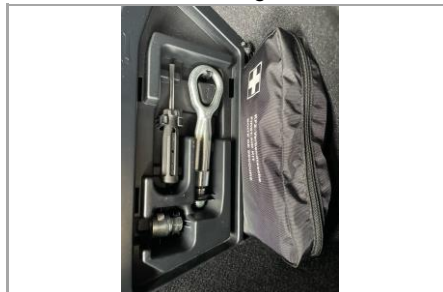
Tool Kit - Image 1 of 1