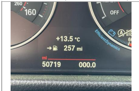
Vehicle has Fuel (20 miles minimum) -