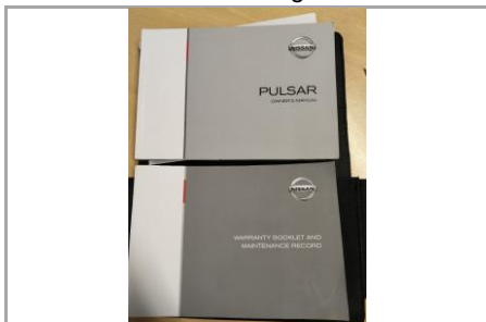
Handbook - Image 1 of 1