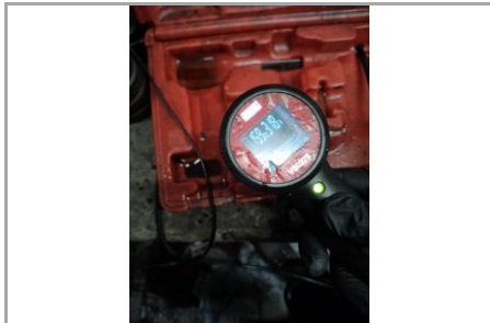
Brake Fluid Level - Image 1 of 1