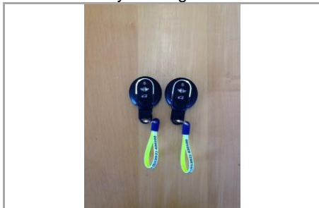
2 Keys - Image 1 of 1