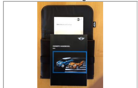
Handbook - Image 1 of 1