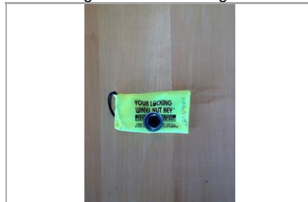
Locking Wheel Nut - Image 1 of 1